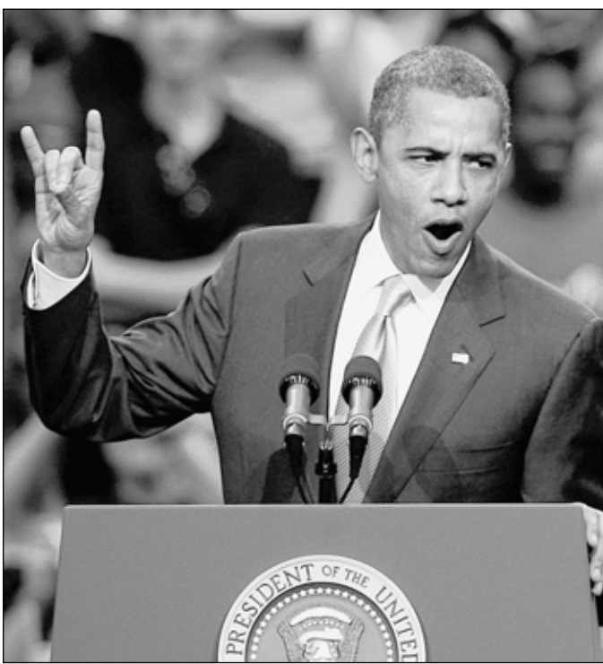
President Barack Obama gives a “hook ‘em horns” sign as he starts a speech Monday at the University of Texas in Austin.

wards?” — played well to his lunch crowd. Later, he was the headline draw at a fundraiser in Dallas that raised about $650,000 to help Democrats in key Senate races, held at a private home within about five miles from where Bush now lives. And in between came an education speech at the University of Texas, where the screams of students prompted Obama to raise a voice even louder, combining for a raucous campaign feel. This is Obama’s August offensive, a string of tactical, time-gobbling campaign stops to raise a bunch of money and revitalize Democratic voters. The traditional result of approaching midterm elections is that the party of the sitting president loses seats; in this case, with anti-incumbency fervor soaring, Democrats could be in for a lashing.